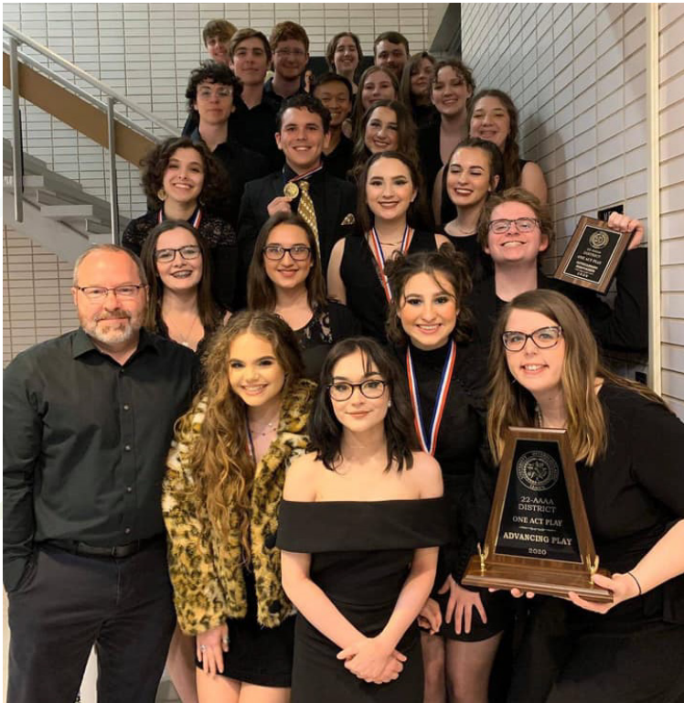
Little Cyprus Mauriceville, District Champions, 2020 One Act Play, Anatomy of Gray .

March in the Department of Theatre & Dance brings many events that the department supports across the campus and throughout the community and the region. One of the most exciting of these is high school One Act Play, supported by the University Interscholastic League (UIL) in the state of Texas public schools.